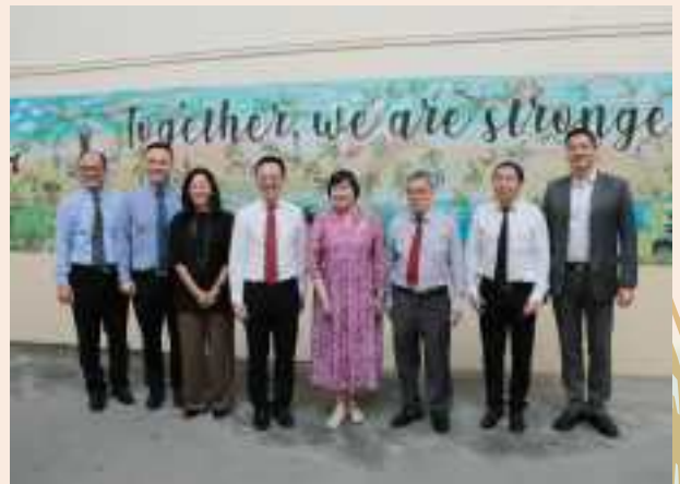
YCKSS School Advisory Committee