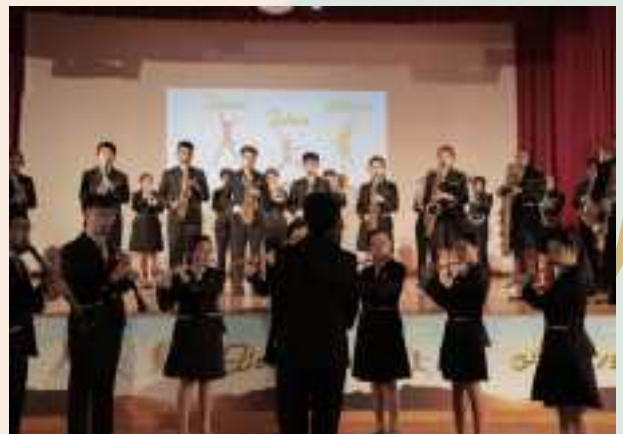
YCKSS Concert Band