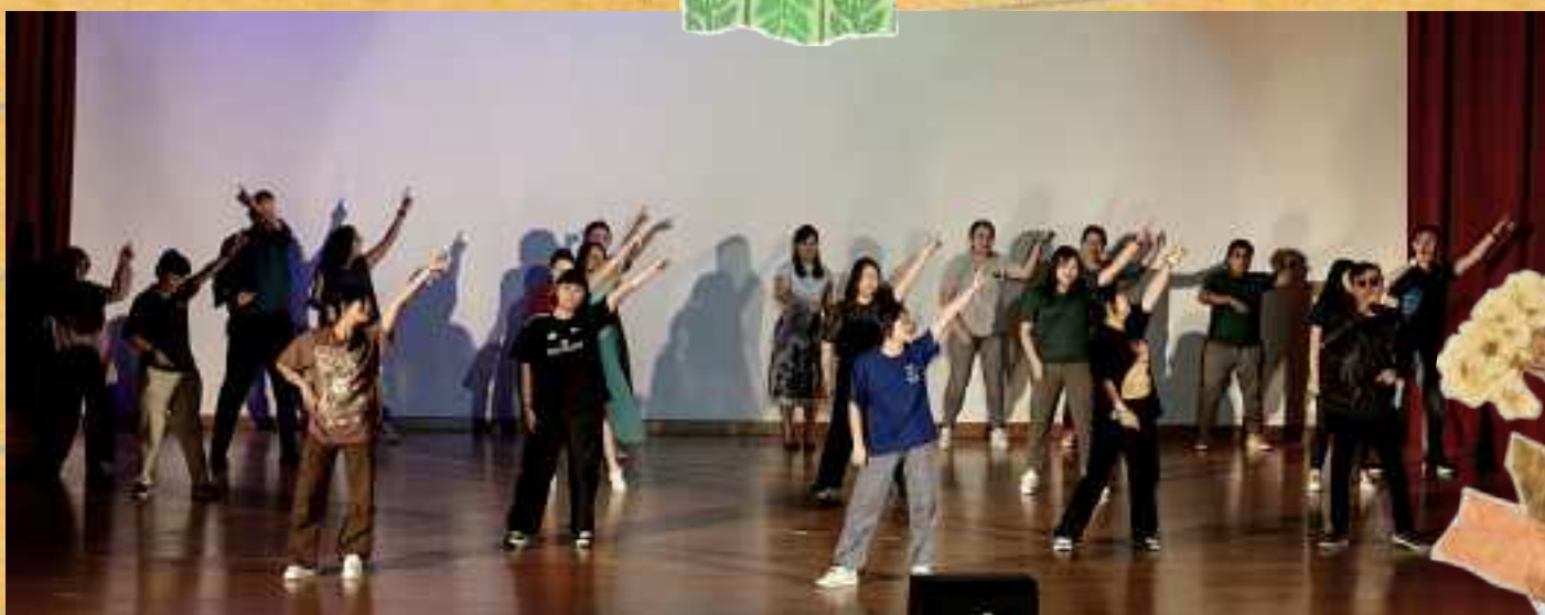
a combined dance item put up by students and teachers of YCKSS

'Planning and organising Teachers' Day was a very memorable and enriching experience for me. Through all the planning and preparation sessions with the other EXCO members, I got to know them better. Even though it may be stressful juggling school work and planning the event, we were motivated to put together an event to be remembered and enjoyed by the teachers.'