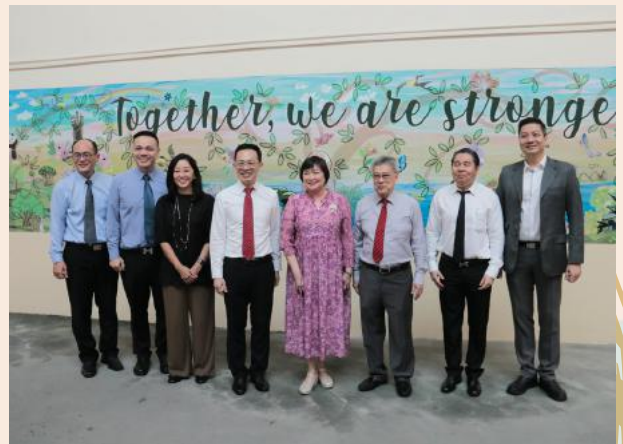
YCKSS School Advisory Committee