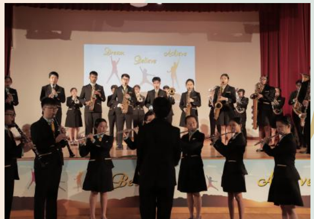
YCKSS Concert Band