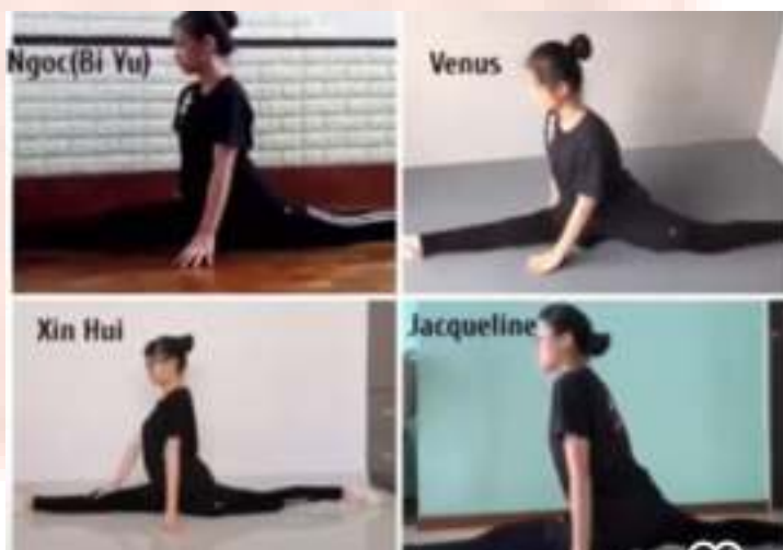
The YCKSS Chinese Dancers formed a team of 21 to perform splits, bridges and front leg kicks for 21 seconds each