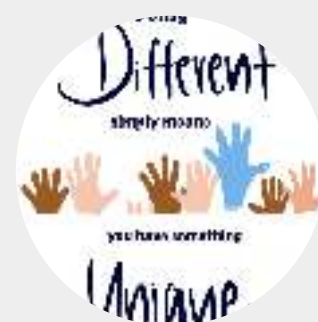
One of a series of Digital artworks designed by students

“For my Challenge, I decided to share 21 pieces of my digital artworks to raise funds for AVSW 2021. At times, I was worried that I would not be able to complete the 21 pieces but I enjoyed sketching them and sharing my works with others. I was very pleased that my friends and family supported my effort in raising funds for this meaningful event. Through this event, we could promote greater awareness about persons with autism. My wish is for them to be respected and included in society!”